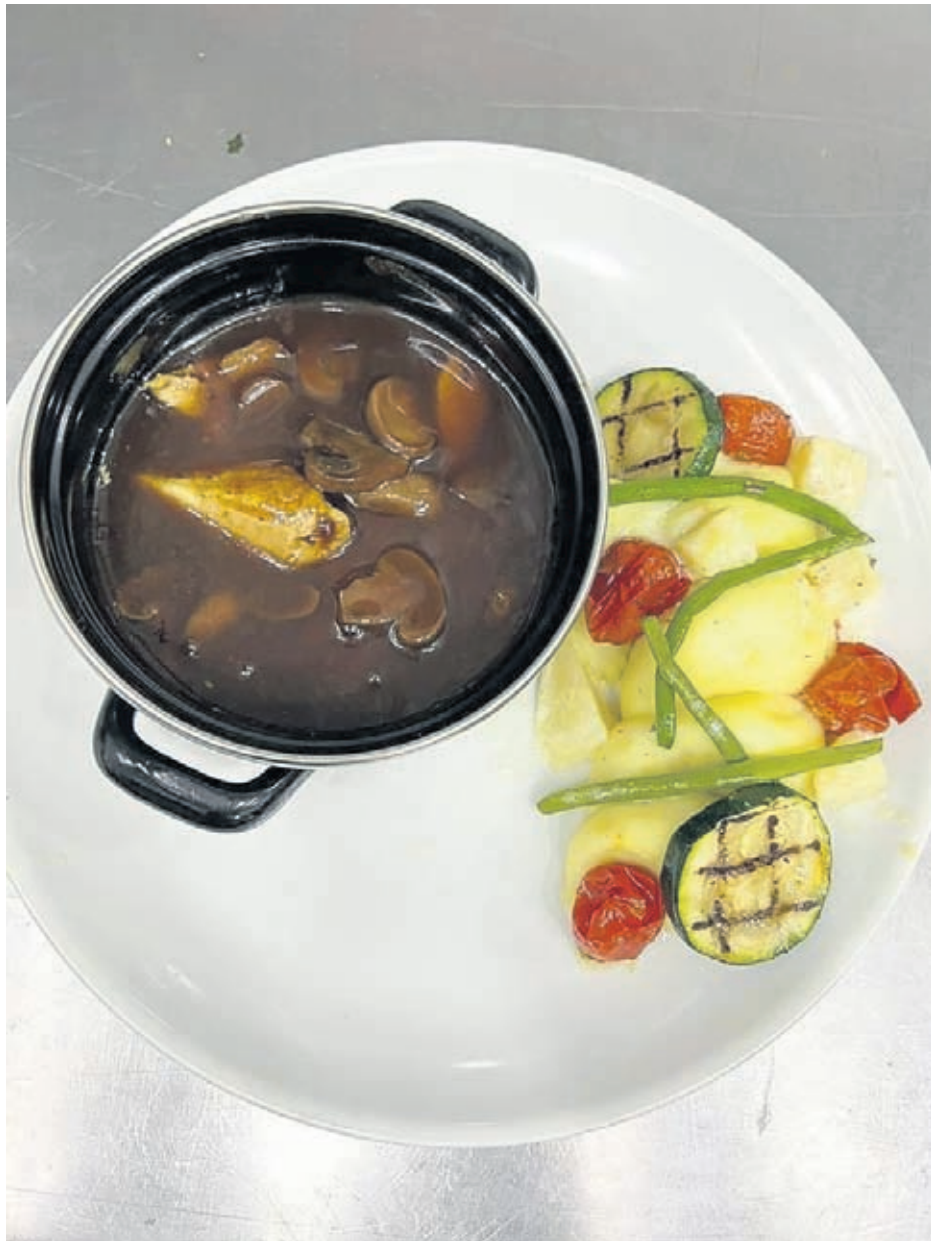
This unique restaurant situated in Aruba's only Dutch windmill is definitely worth a visit. With the essence of the Netherlands combined with the warmth of Aruba, you are in for a real Royal treat.